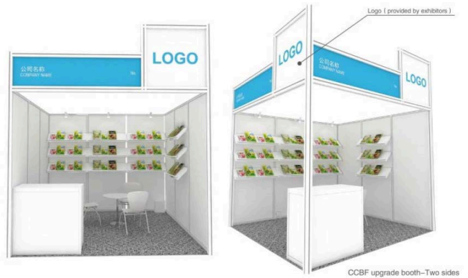
CCBF upgrade booth—Two sides